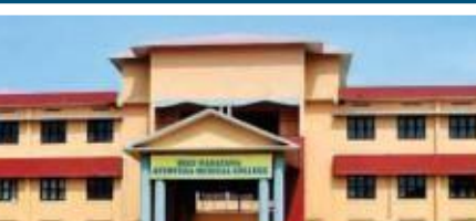
Sree Narayana Institute of Ayurvedic Studies & Research, Puthur, Kollam