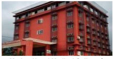
Markaz Unani Medical College & Hospital, Kozhikode