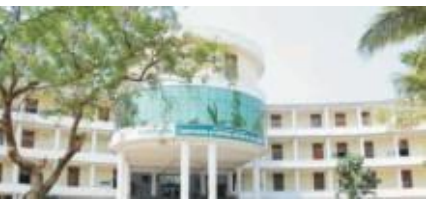
Santhigiri Ayurveda Medical College, Palakkad