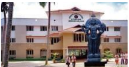
Pankajakasthuri Medical College, Thiruvananthapuram