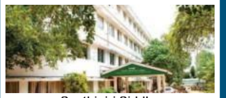
Santhigiri Siddha Medical College, Thiruvananthapuram