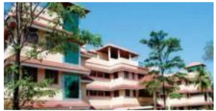
Mannam Ayurveda Co-operative Medical College, Pandalam