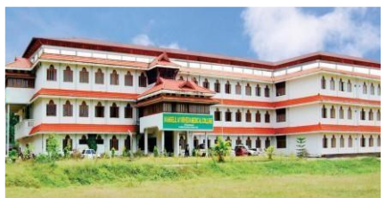
Nangelil Ayurveda Medical College, Kothamangalam