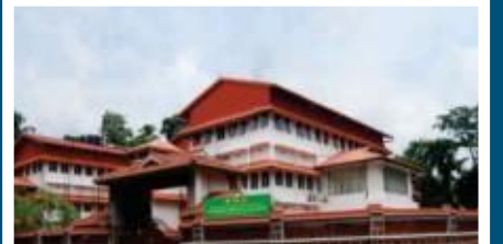
P.N.N.M Ayurveda Medical College, Shoranur