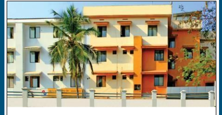
KMCT Ayurveda Medical College, Calicut