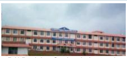
P.N.Panicker Souhruda Ayurveda Medical College, Kasargod