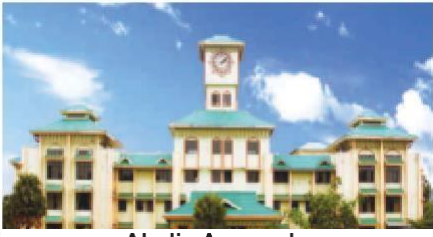
Ahalia Ayurveda Medical College Hospital, Palakkad