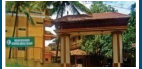
MVR Ayurveda Medical College Parassinikadavu, Kannur