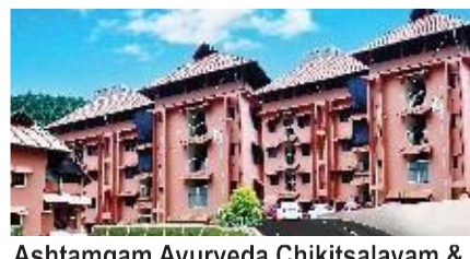
Ashtangam Ayurveda Chikitsalayam & Vidyapeedham (AACV), Vavanoor